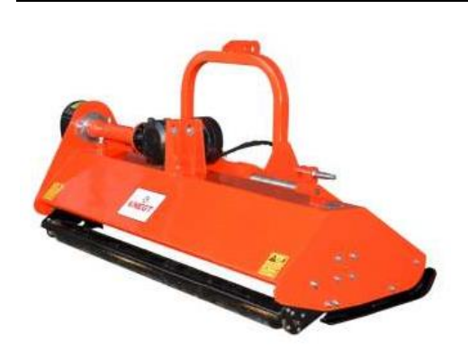
Verge Flail Mower HD (140HD, 160HD, 180HD)