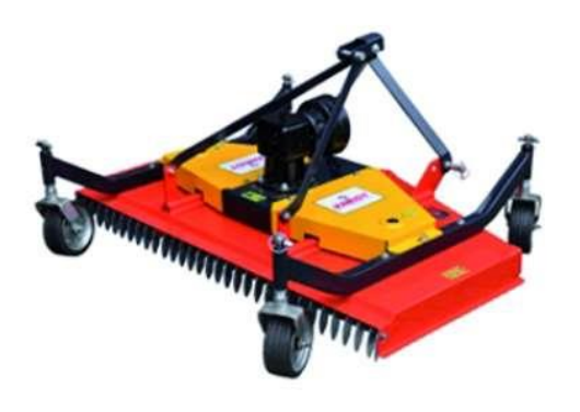
Flail Mowers - Side Shift (KMSS 125, 145, 175, 220)