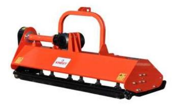
Verge Flail Mowers (KNVM 125, 145)