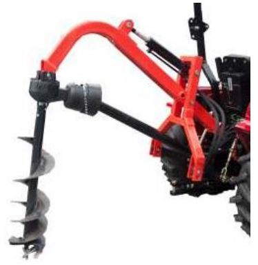
PBPH (HD - equipped with hydraulic cylinder)