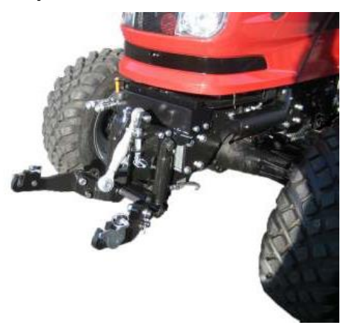
Front 3 pt. hitch