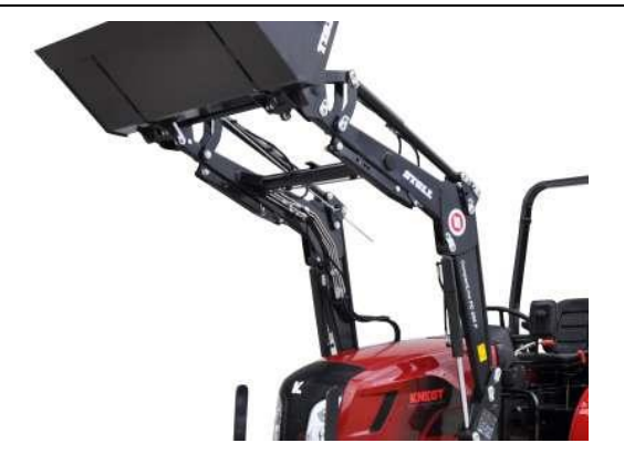
Adapter Frame Skid-Euro