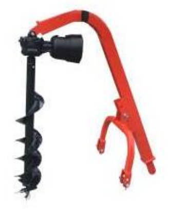
The red tractor that thinks GREEN